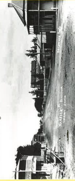
Marsden Street looking south

Established to 'educate and elevate the tone of the town' the Institute boasted 2000 books by the year 1900. It was a popular venue for social functions and later the town's first picture show. In 1901 Banjo Paterson spoke at a political rally. The building was occupied by the Country